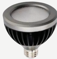
PAR30 Wet Location