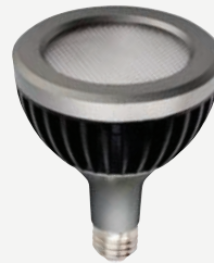
PAR30 Longneck Wet Location