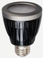
PAR20 Wet Location