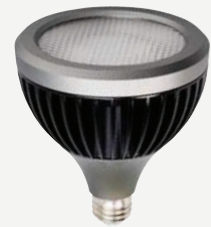
PAR38 Wet Location